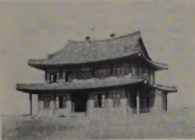
PYENGYANG UNION SCHOOL

Prayers faculty in the office of the principal, beseeching God that the coming term might be marked by the conquest of the entire student body. One morning while Answered this prayer meeting was in progress, the two missionaries in charge of the school—one a Presbyterian and the